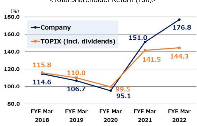
<Total Shareholder Return (TSR)>

Also, in addition to the increase in the Company's ROE, in our efforts to enhance shareholder returns, the Company's total shareholder return has increased to a level that significantly outperforms the current TOPIX average.